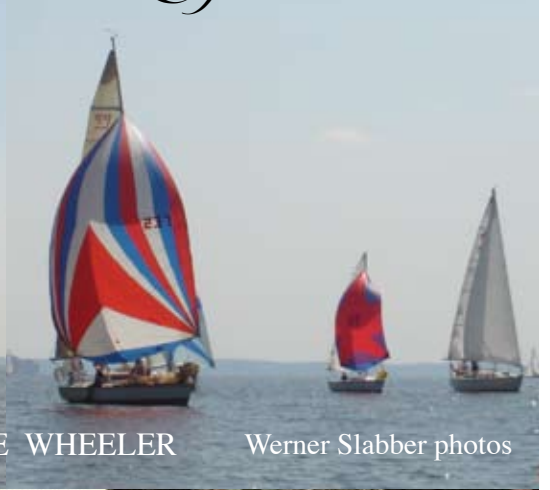
Werner Slabber photos