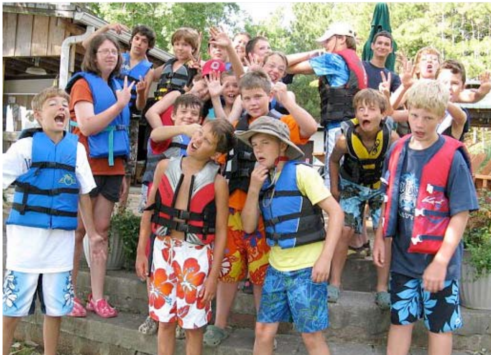
THE FUTURE OF SAILING HAS A FUN COMPONENT.