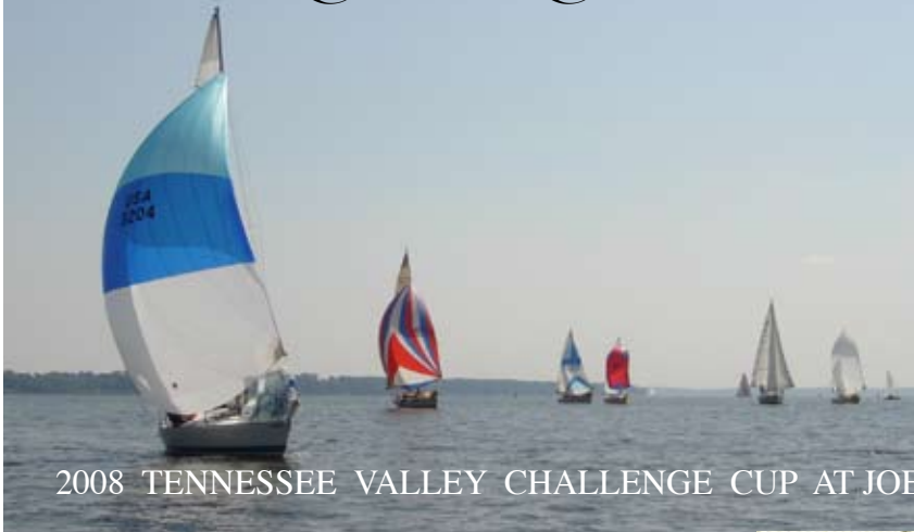
2008 TENNESSEE VALLEY CHALLENGE CUP AT JOE WHEELER