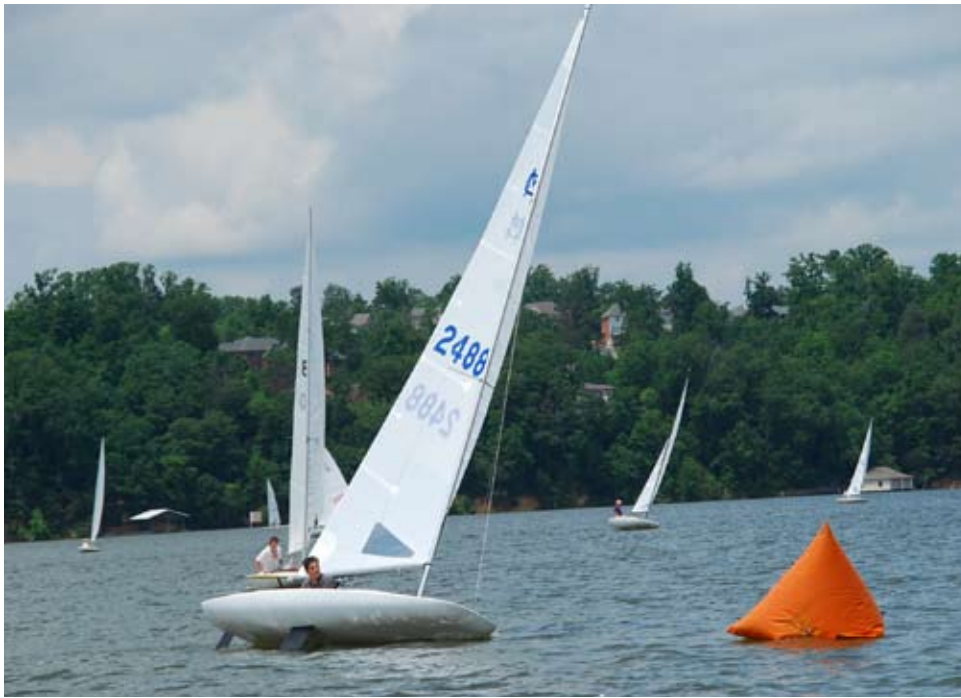
SCOWABUNGA 2009 MC SCOWS RACING — see story on page 2

was organized on July 25, 1940, in order to promote sailing in the Chickamauga Lake area and particularly in Chattanooga; to teach its members to talk the language of the sea and build up a marine tradition for "The Great Lakes of The South"; to help promote water safety and a code of ethics for the waterways; to form a social and activity nucleus for people in the area interested in sailing; and to develop an active relationship with other sailing and boating organizations to promote racing and other boating activities.