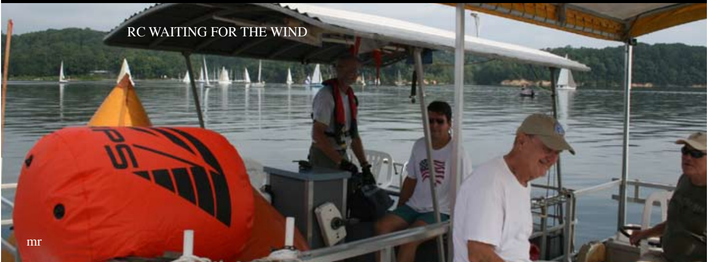
RC WAITING FOR THE WIND