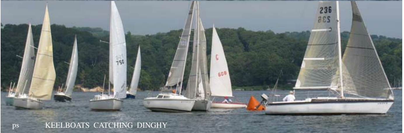
ps KEELBOATS CATCHING DINGHY