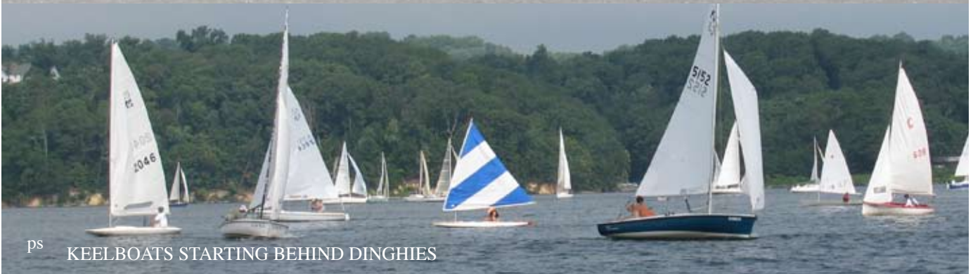
ps KEELBOATS STARTING BEHIND DINGHIES