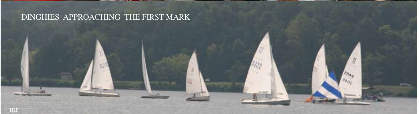
DINGHIES APPROACHING THE FIRST MARK