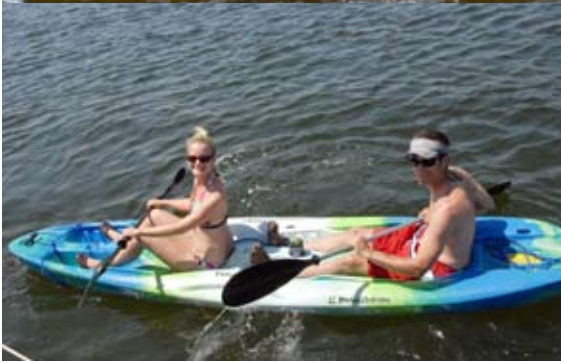
A few shots from the talented eye and camera of Jane Overbeck of the 2010 Catalina 22 Northern Gulf Coast Cruise.