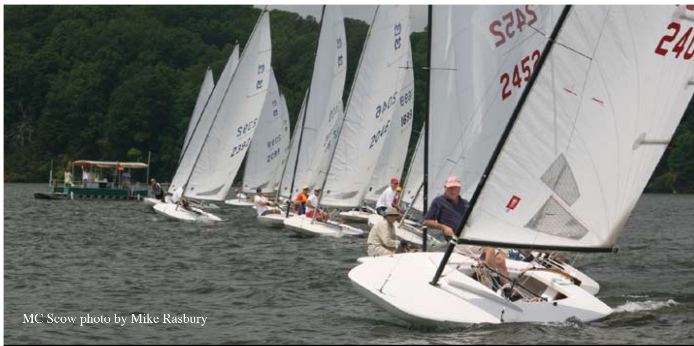
MC Scow