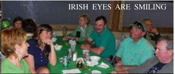
IRISH EYES ARE SMILING