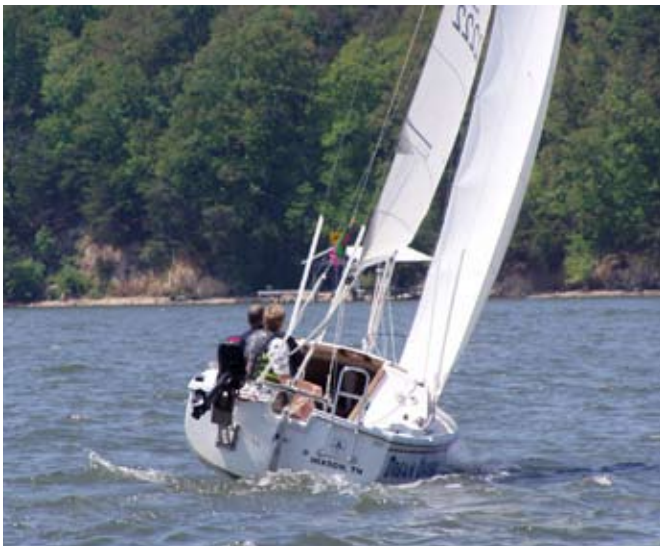
DREAM CHASER HEADING IN AFTER A GOOD WEEKEND OF RACING