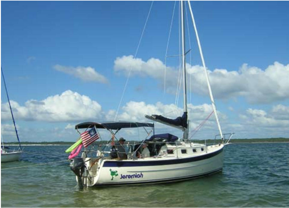
Kent & Jane Overbeck beach anchored off Crooked Island, Florida, on the 2007 Fall Gulf Coast Cruise

was organized on July 25, 1940, in order to promote sailing in the Chickamauga Lake area and particularly in Chattanooga; to teach its members to talk the language of the sea and build up a marine tradition for "The Great Lakes of The South"; to help promote water safety and a code of ethics for the waterways; to form a social and activity nucleus for people in the area interested in sailing; and to develop an active relationship with other sailing and boating organizations to promote racing and other boating activities.