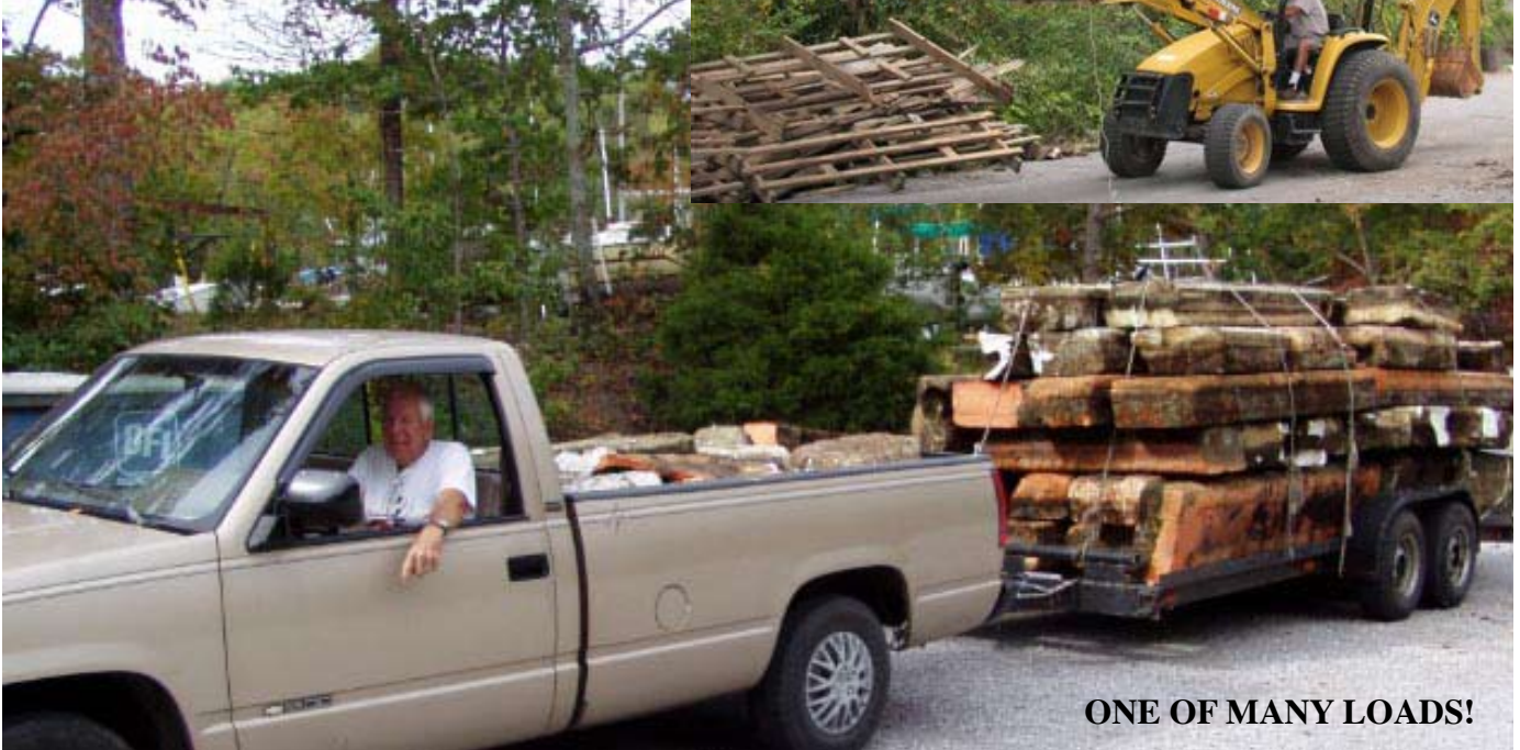
ONE OF MANY LOADS!