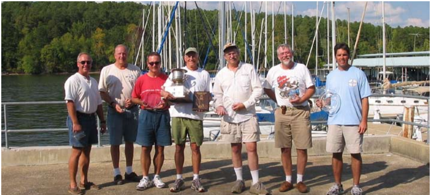
SOME OF THE TVCC WINNERS