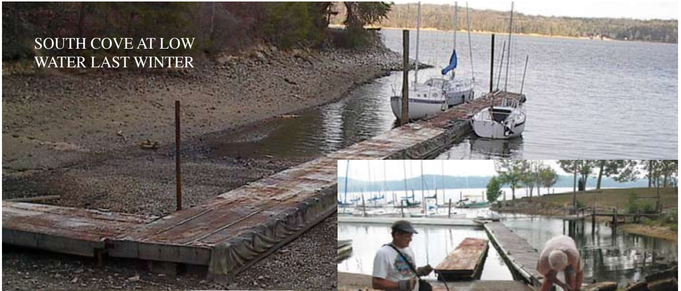
SOUTH COVE AT LOW WATER LAST WINTER